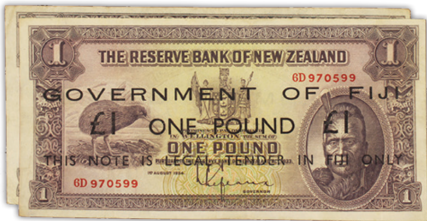
Lot 659 - 1942 Fiji Overprinted Emergency Pounds