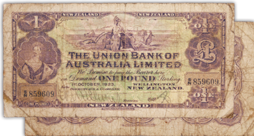
Lot 683 - 1923 Union Bank of Australia One Pound