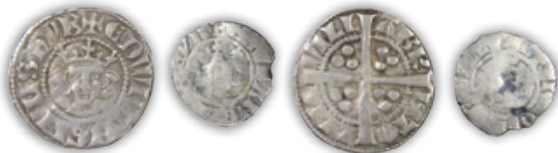
Lot 227 (Two coins)