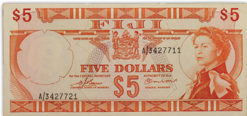
Lot 661 - 1974 Five Dollar Fiji Errors (1 of 6 shown)