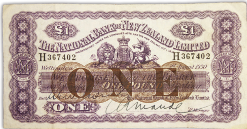
Lot 681 – 1930 National Bank of New Zealand One Pound