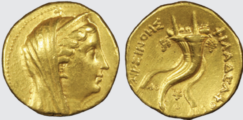
Lot 213 Ptolemy II Octodrachm