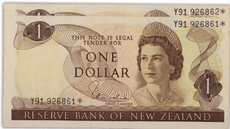
Lot 704 - Hardie $1 Consecutive Serial Alignment Errors (2/11 shown)