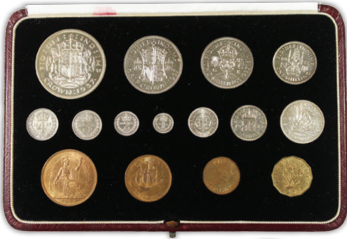
Lot 262 (Half Size)