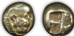
Lot 198 (Enlarged 2x)