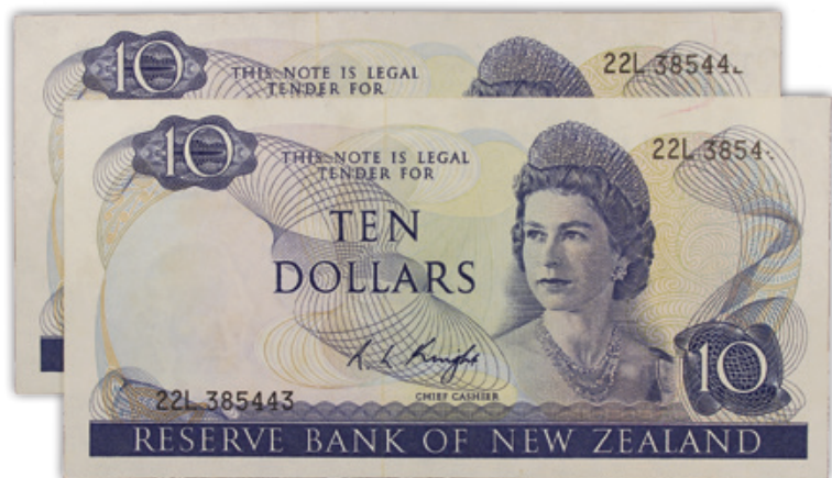
Lot 698 - Knight $10 Consecutive Serial Errors