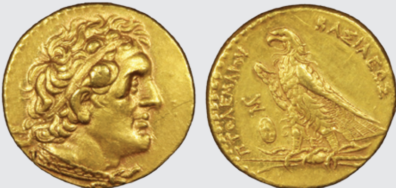
Lot 214 Ptolemy II Pentadrachm