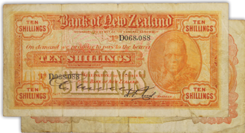
Lot 677 - 1931 Bank of New Zealand Ten Shillings