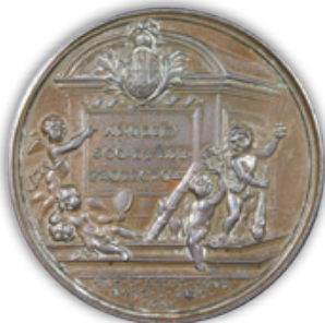
Lot 602 (Two medals)