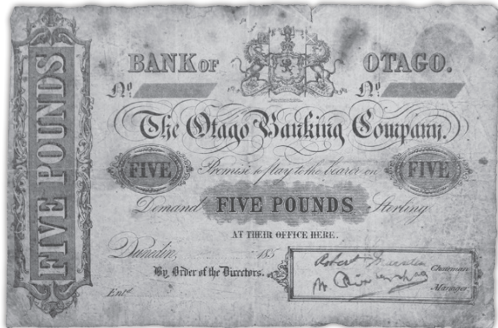
Lot 674 - 1850s Otago Banking Company Unissued Five Pounds