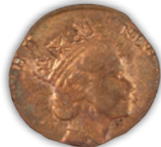
Lot 367 (Enlarged 1.5x)