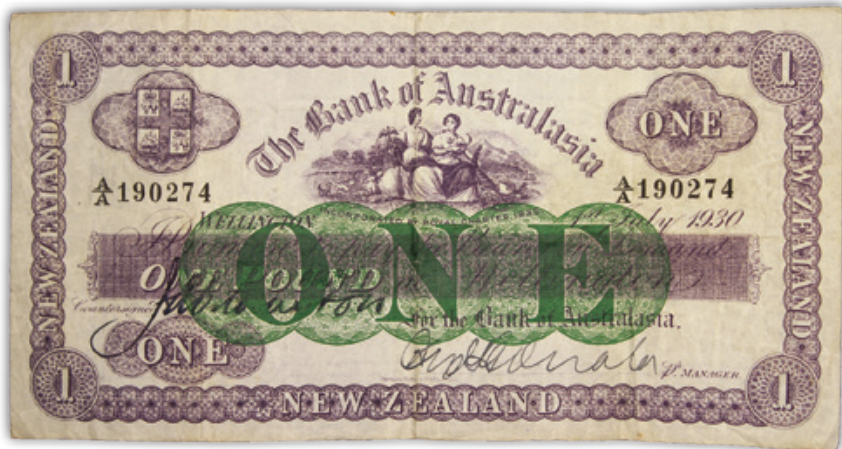
Lot 675 – 1930 Bank of Australasia One Pound