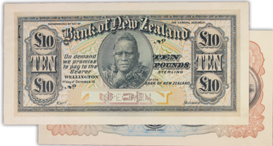
Lot 680 - 1924 Bank of New Zealand Uniface Specimen £10 Pair