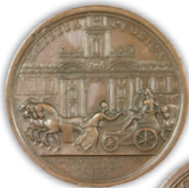
Lot 601 (Three Quarter Size)