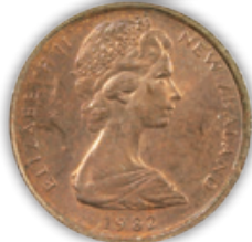
Lot 366 (Enlarged 1.5x)