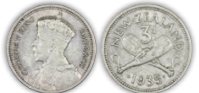
Lot 352 (Enlarged 1.5x)