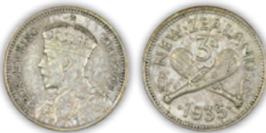
Lot 351 (Enlarged 1.5x)