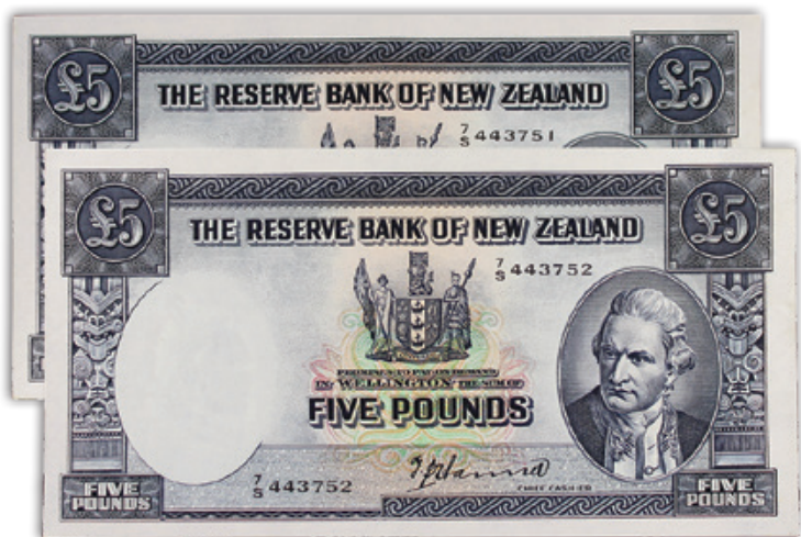
Lot 689 - Hanna Five Pounds Consecutive Serial Pair