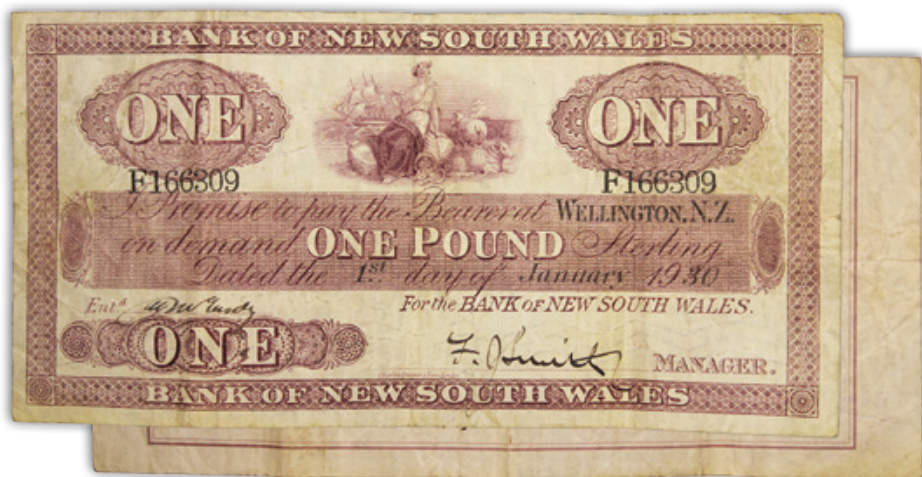
Lot 682 – 1930 Bank of New South Wales One Pound