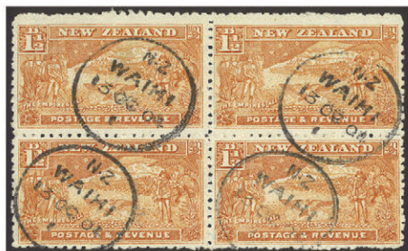
751 - image reduced