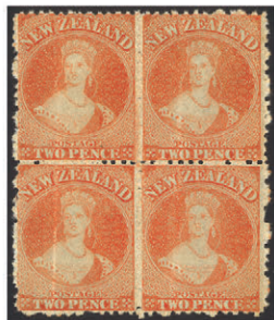
642 - image reduced