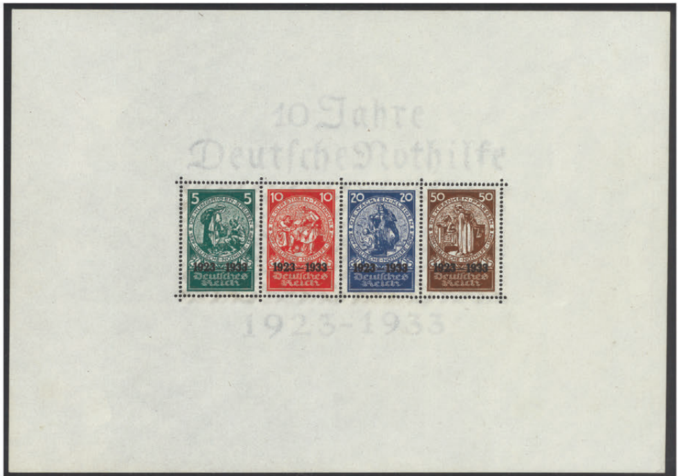
3469 (image reduced in size)