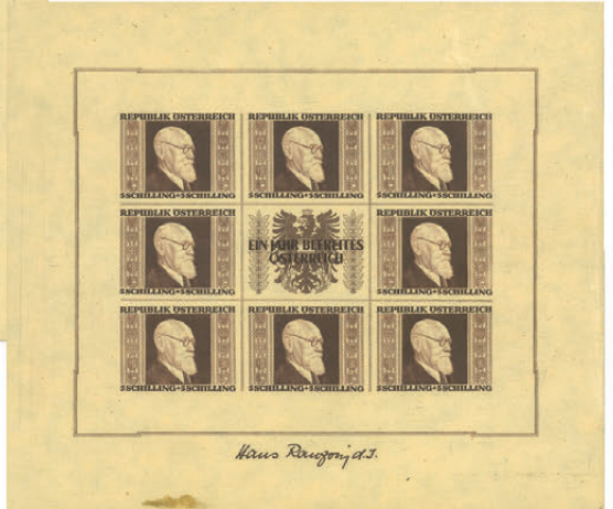
3353 (image reduced in size)