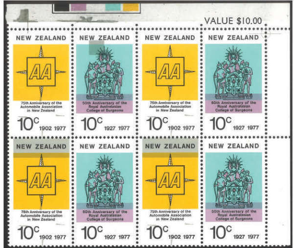
ex 1451 - image reduced