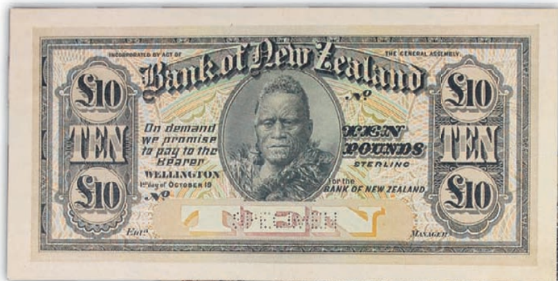
Lot 485 BNZ Ten Pounds Uniface Specimen Pair