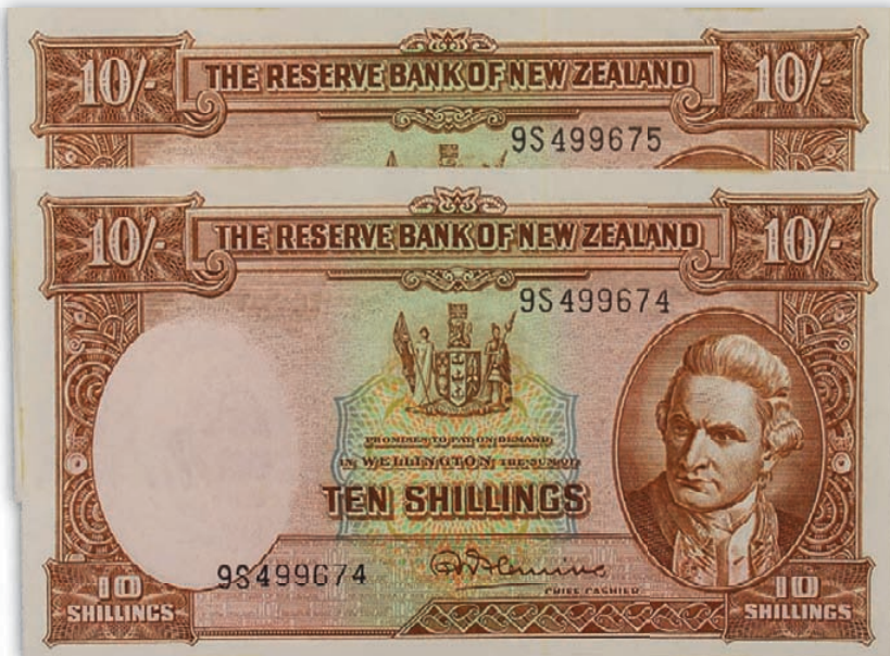
Lot 501 RBNZ 10 Shillings, Fleming, Last Prefix