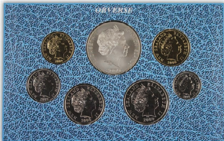
Lot 254 NZ UNC Set 2000 with Solomon Islands Mule