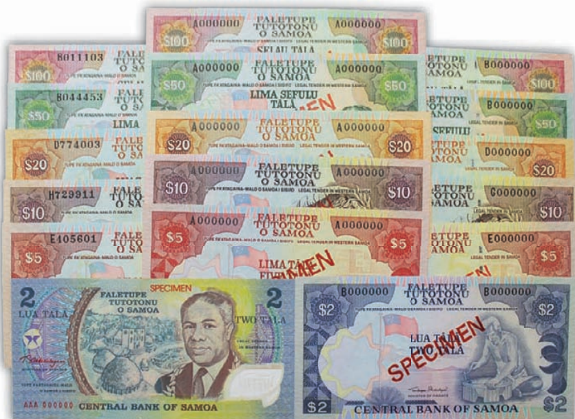
Lot 475 Samoa Specimen & other banknotes