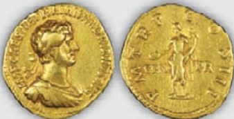
Lot 155 ROME Hadrian Aureus AD 119 - 120