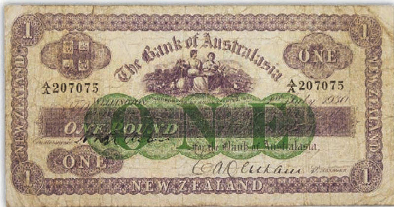
Lot 483 Bank of Australasia, One Pound 1930