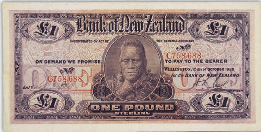
Lot 486 BNZ Uniform Issue One Pound 1926 - 31