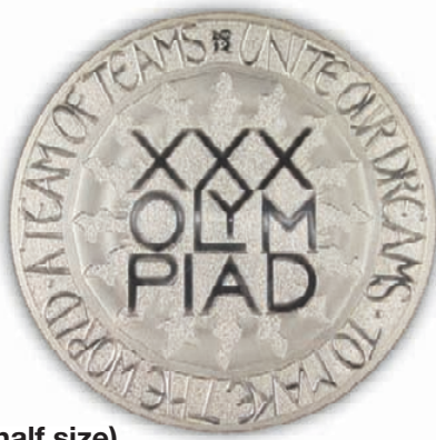
Lot 188 (half size)