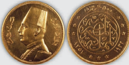
Lot 119 Egypt 500 piastres 1932