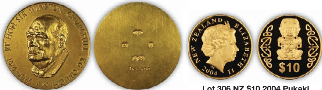
Lot 407 Winston Churchill Medal 1965 (2/3 size)