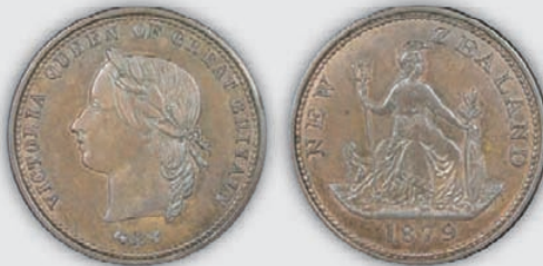
Lot 314 NZ Pattern Penny 1879