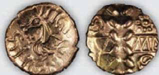
Lot 200 England Dumnocoveros Tigirseno AD 25 - 35 Stater