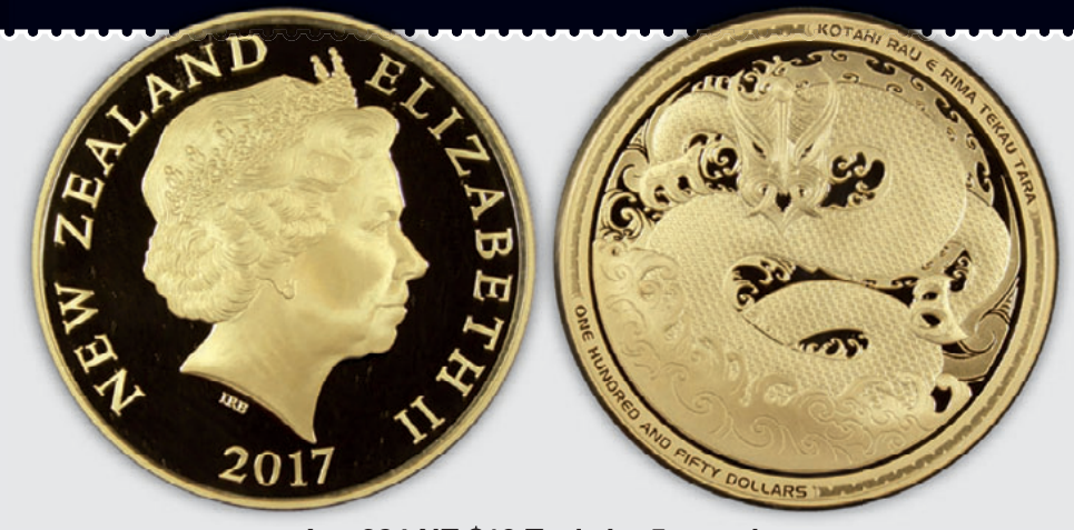
Lot 384 NZ $10 Taniwha 5 oz coin