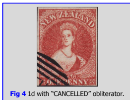
Fig 4 1d with "CANCELLED" obliterator.

This is only one of three covers recorded bearing a 1d dull carmine pair, and believed to be the earliest recorded date of use of the 1d value, 13 August 1855. This cover, part of New Zealand's heritage, formerly part of the Joseph Hackmey collection of New Zealand is now held in The Museum of New Zealand, Te Papa Tongarewa.