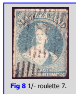
Fig 8 1/- roulette 7.

During the 1860s considerable experimental methods of separations were undertaken; including perforating, rouletting, serrating and pin perforating machines.