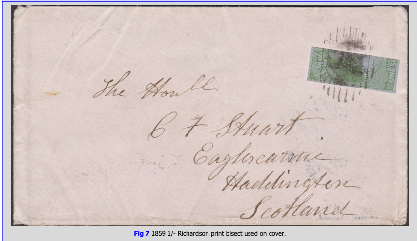
Fig 7 1859 1/- Richardson print bisect used on cover.

According to Odenweller 8 , there are 8 recorded 1/- London print bisects used on cover; the earliest being 11 May 1857 and the latest being 12 October 1858. Figure 6 illustrates the 6 th such cover. Odenweller has recorded the existence of 28 1/- Richardson print bisects on cover; the earliest being 17 July 1858 – this used to Bremen – and the latest being 19 July 1859. Figure 7 features the 21 st such cover. Apart from the first Richardson print bisect used on cover, all the remaining covers or fronts were addressed to Great Britain; all the London print 1/- bisect covers and five of the Richardson print 1/- bisect covers were sent to the Mottram family, in London. All bisected 1/- stamps were bisected vertically.