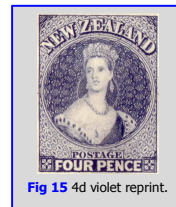
Fig 15 4d violet reprint.

Published in 1950, The Postage Stamps of New Zealand, Volume II contains officially sanctioned reprints of New Zealand's first stamps, or Full-Face Queens. These were printed from the original Perkins, Bacon & Co. dies but in altered colours, on thick unwatermarked cream paper. The colours were altered from those that appeared on the original denomination stamps to one that appeared on a different coloured denomination stamp, viz., 1d blue; 2d vermilion; 3d green; 4d violet - see Figure 15, 6d purple and 1/- orange.