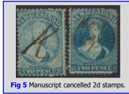
Fig 5 Manuscript cancelled 2d stamps.

Occasionally, one may find Full-Face Queen stamps cancelled by manuscript, and sometimes overstruck by a cancellation applied at a nearby town En-route to its destination. Such situations, arose with the expansion of localities across the country at a faster rate than the New Zealand Post Office could supply them with date stamps. Postmasters were instructed to cancel stamped mail where they did not have any official form of date stamp by writing the name of the town (or an abbreviation thereof) in black ink across the stamp. Figure 5 features two manuscript cancelled 2d Full-Face Queen stamps: K & Ho Ho being, respectively from Kowhai & Ho Ho Creek.