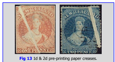
Fig 13 1d & 2d pre-printing paper creases.

In addition to these 142(+) Full-Face Queens, there are collectors who enjoy chasing after varieties. Figure 11 features an eminently collectable variety: a 2d blue (SG 96a), p13, on unwatermarked thick, soft paper with double perfs at the left – together with the reverse of the stamp.