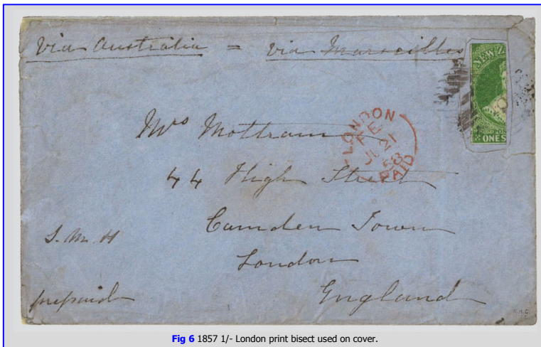
Fig 6 1857 1/- London print bisect used on cover.

Until 1859, only the three initial denominations could be used for postage when the 6d brown stamp appeared. Additional denominations followed in 1863 (3d) and in 1865 (4d) 6 . However, bisected 1/- stamps were used in Otago during the period March 1857 to 1859 when 6d was the ½oz. rate for letters to Britain but no 6d stamps existed 7 and the stocks of 2d stamps was almost non-existent.