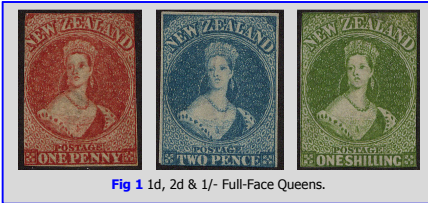
Fig 1 1d, 2d & 1/- Full-Face Queens.

New Zealand's first stamps featuring the Chalon portrait of Queen Victoria, were issued 15 years after the world's first stamps – Great Britain's 1d black and 2d blue. Unlike Great Britain, in May 1840 New Zealand had a very small population. European settlement of the colony commenced during the 1840s, stamps featuring the arrival of settlers were issued in 1940 (3d centenary of immigrants landing on Petone Beach), 1948 and 1950 (centenaries of Otago and Canterbury, respectively). As in Britain, prior to the supply of stamps, New Zealanders had the option of prepaying the cost of sending letters, or alternatively they could send letters so that the recipient paid the postage.