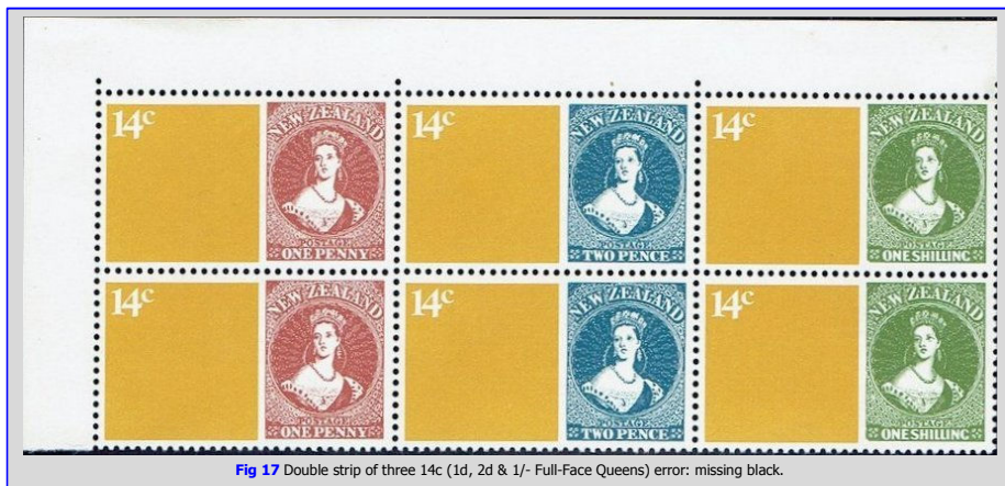
Fig 17 Double strip of three 14c (1d, 2d & 1/- Full-Face Queens) error: missing black.

Finally, in 2005 to celebrate the sesquicentenary of New Zealand's first stamps an imperf 1d Full-Face Queen was depicted on one of the three 45c stamps released for this event, Figure 18. This can also be found in miniature sheets of the same issue.