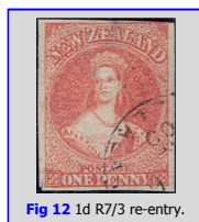
Fig 12 1d R7/3 re-entry.