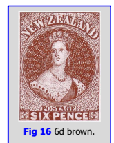
Fig 16 6d brown.

In 1988 New Zealand's oldest philatelic society celebrated its centenary. To mark the occasion, New Zealand Post issued two 40c stamps and a $1.00 miniature sheet. The latter contained an impression of an imperforate 6d brown Full-Face Queen that was printed on phosphorescent paper with poly vinyl alcohol gum and dextrin added (pvad gum), shown as Figure 16.