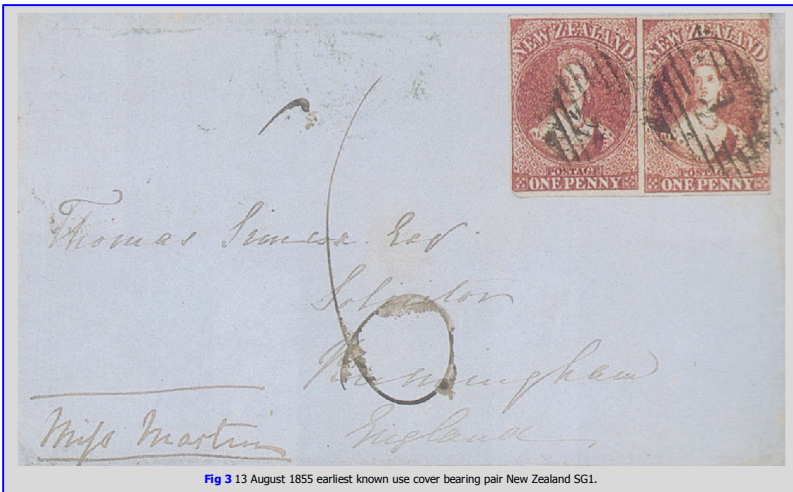
Fig 3 13 August 1855 earliest known use cover bearing pair New Zealand SG1.

Figure 1 depicts 1d, 2d and 1/- Full-Face Queens, which were first placed on sale in Auckland, on 20 July 1855. These were printed by Perkins, Bacon & Co., in London, without perforations in sheets of 240 stamps in 20 horizontal rows of 12, on watermarked paper featuring a large six-pointed star, illustrated in Figure 2. The printing plates were also shipped out to New Zealand along with the supplies of stamps. Of the 1d 12,000; 2d 66,000 and 1/- 8,000 were initially printed.