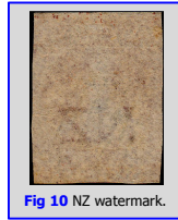
Fig 10 NZ watermark.

In 1862 New Zealand's Full-Face Queen stamps were printed on a very thin or, pelure paper. This is easy to detect as the ink colour often shows through to the rear owing to the paper's thinness. Unfortunately, the 2d stamp printed on pelure paper usually appears to be washed out, as may be seen in Figure 9