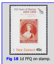
Fig 18 1d FFQ on stamp.

Finally, in 2005 to celebrate the sesquicentenary of New Zealand's first stamps an imperf 1d Full-Face Queen was depicted on one of the three 45c stamps released for this event, Figure 18. This can also be found in miniature sheets of the same issue.