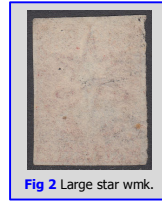
Fig 2 Large star wmk.

Figure 1 depicts 1d, 2d and 1/- Full-Face Queens, which were first placed on sale in Auckland, on 20 July 1855. These were printed by Perkins, Bacon & Co., in London, without perforations in sheets of 240 stamps in 20 horizontal rows of 12, on watermarked paper featuring a large six-pointed star, illustrated in Figure 2. The printing plates were also shipped out to New Zealand along with the supplies of stamps. Of the 1d 12,000; 2d 66,000 and 1/- 8,000 were initially printed.