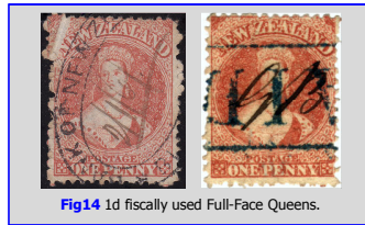
Fig14 1d fiscally used Full-Face Queens.

New Zealand's Full-Face Queens and 1 st Side Face definitives were only valid for POSTAGE purposes as they were inscribed thus.