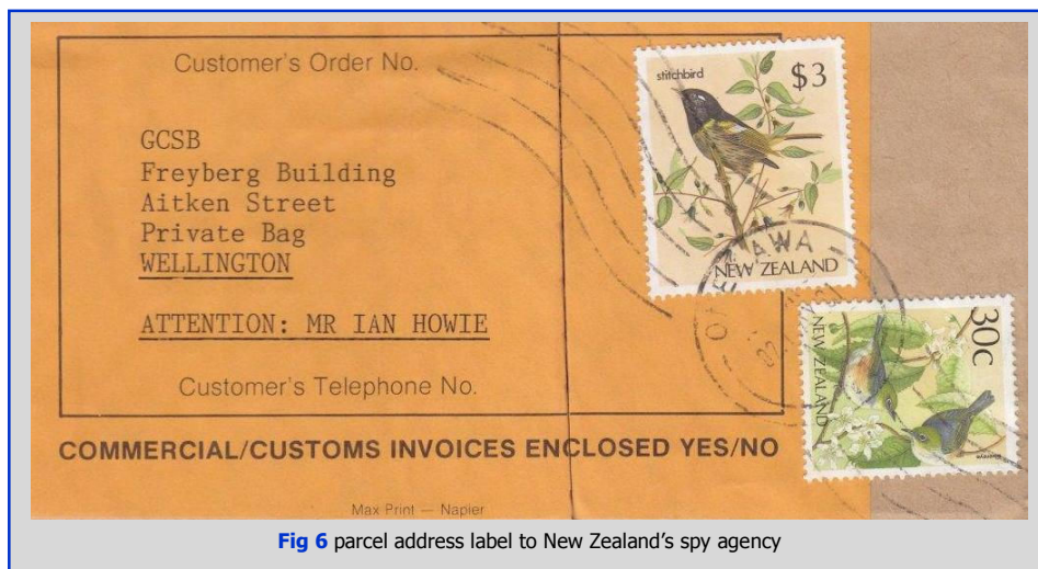
Fig 6 parcel address label to New Zealand's spy agency

Claims and counter claims were made about what the GCSB did and did not do and on 15 September 2014 New Zealand's Prime Minister (John Key) was reported in The New Zealand Herald as saying that, "The GCSB undertakes cyber security operations to protect individual public and private sector entities from the increasing threat of cyber-attack, and this is very important work."