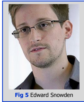
Fig 5 Edward Snowden

His stated hobbies include skateboarding, triathlon, reading, and blogging. 5 Perhaps Edward Snowden ought to take up stamp collecting; then he would be in good philatelic company with some other illustrious or infamous spies!